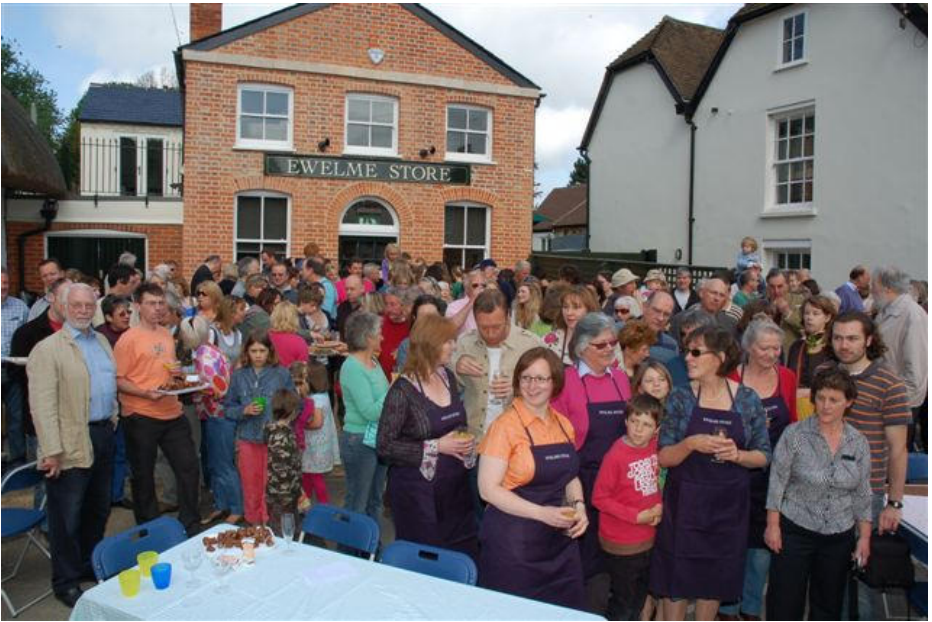
The committee and friends posing for the obligatory photograph